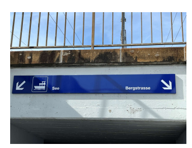
In direction of 'Bergstrasse'