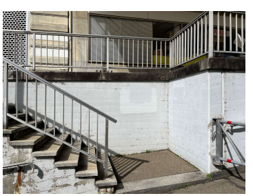
to the left